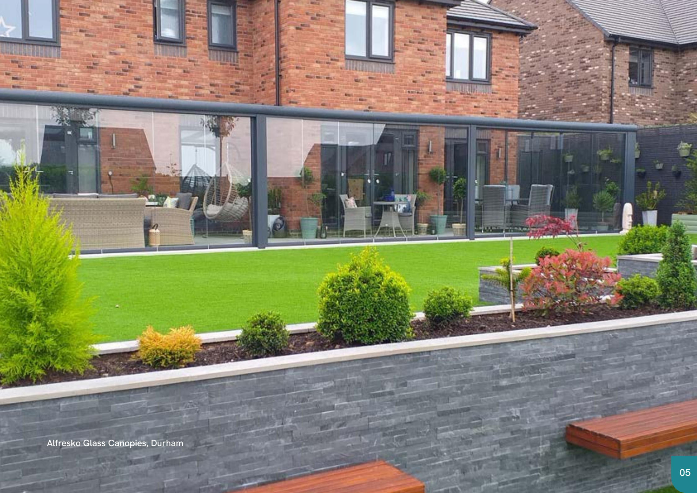
Alfresco Glass Canopies, Durham